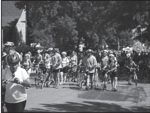
Thousands of RAGBRAI riders coming into Parkersburg on Thursday, July 29th.