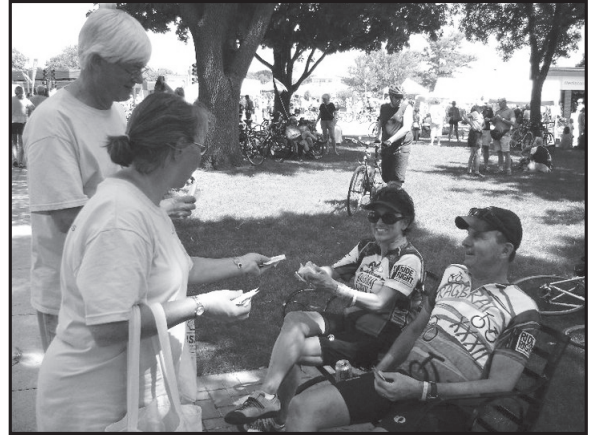
TEAM Panda members talked with bikers about voter accessibility and our services. Team members also handed out wet wipes – a welcome gift.