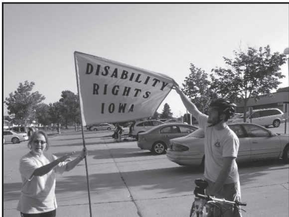
Iowa P&A’s TEAM Panda made a flag to increase awareness and help team members find each other.