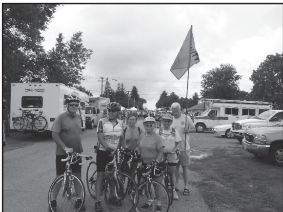
Some TEAM Panda members taking a break to pose for the camera. A total of ten team members participated in RAGBRAI XXXVIII.